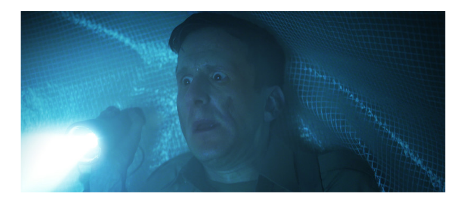
The Bunker - Director's Cut Download Complete Edition

Download ->->-> <a href="http://bit.ly/2JXYrAM">http://bit.ly/2JXYrAM</a>